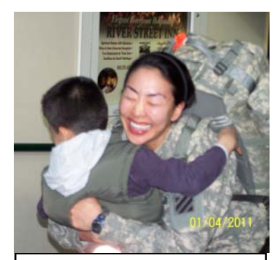
Reuniting with family at the Savannah/Hilton Head International airport after deployment to Iraq.

Please email comments to <u>javaadvocate@gmail.com</u>.