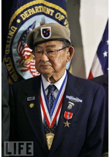
Grant Hirabayashi at a news conference at the Department of Veterans Affairs Headquarters on October 18, 2006.