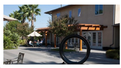
Fisher House helping keep families together as soldiers heal at SAMMC

For 2014, JAVA's Executive Council has decided to support the Fisher House organization. The Fisher House program was started in 1990. Currently, there are 64 donated Fisher Houses that are located on 23 military installations and 24 Veterans Administration Medical Centers. The houses are available without charge to families of currently serving military personnel and veterans that are hospitalized in a military or Veterans Administration hospital. Separate living quarters along with shared kitchens, dining areas, and living rooms, are provided free of cost.