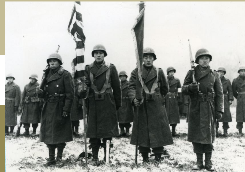
442 nd Color Guard, Bruyeres, France

NOVEMBER 1, 2011 10:30 A.M. TO 12:00 NOON WASHINGTON HILTON HOTEL WASHINGTON D.C.