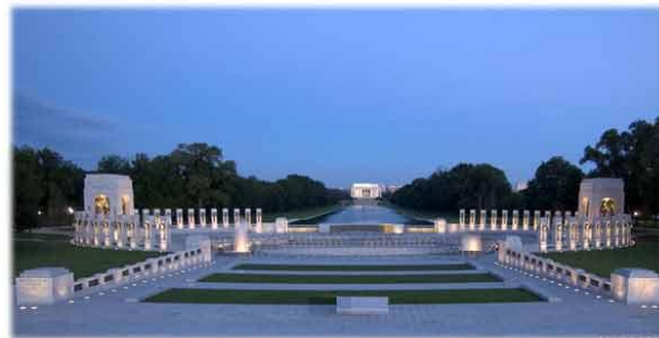
WW II Memorial with Lincoln Memorial in background