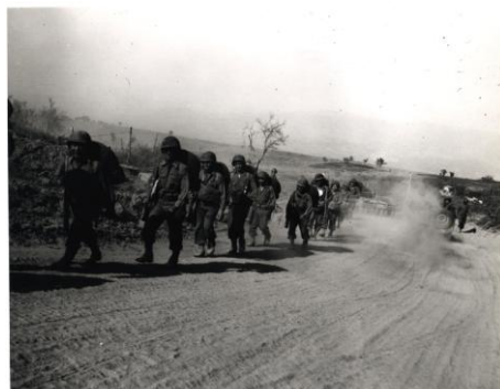
442 nd . Moving up to the front lines