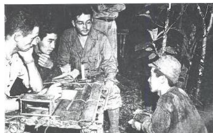
Two Nisei interpreters and an intelligence officer interrogate a Japanese POW (right). Papua, New Guinea.