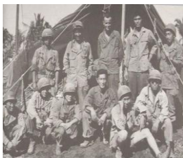
A typical linguist team. Leyte, Philippines